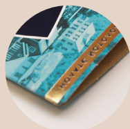
hot foil stamping