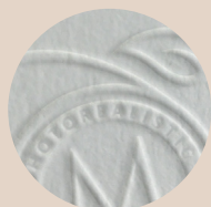
embossing & debossing